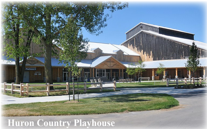
Huron Country Playhouse