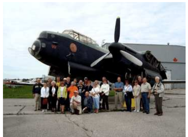
St. Clair Retirees and Friends