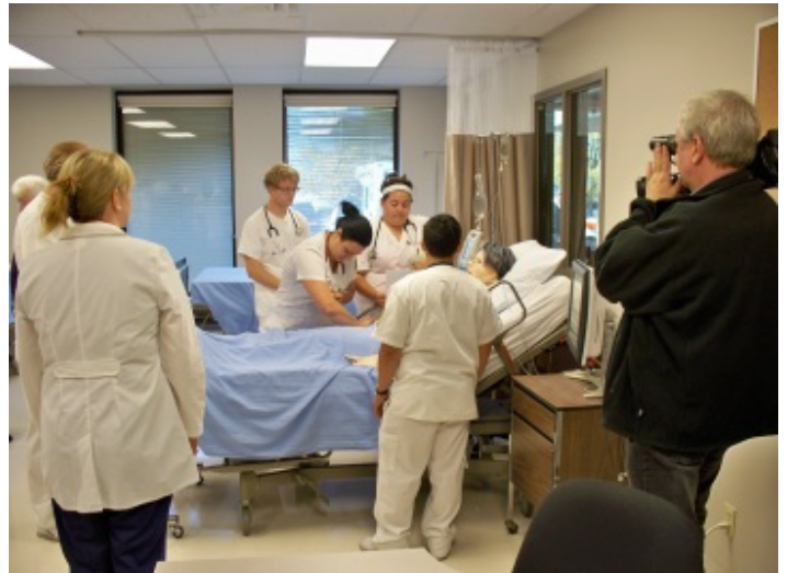
Students in Nursing Lab