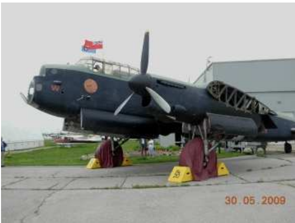
Restoration of the Lancaster Bomber