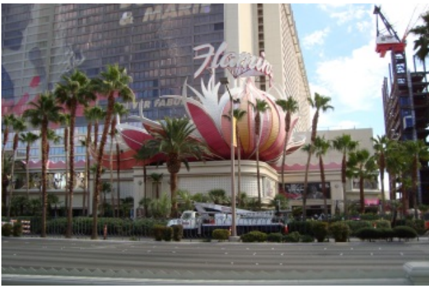
The group stayed at the Flamingo Casino & Resort