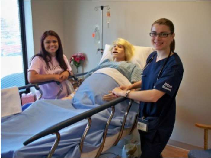
Students in OB GYN birthing Lab