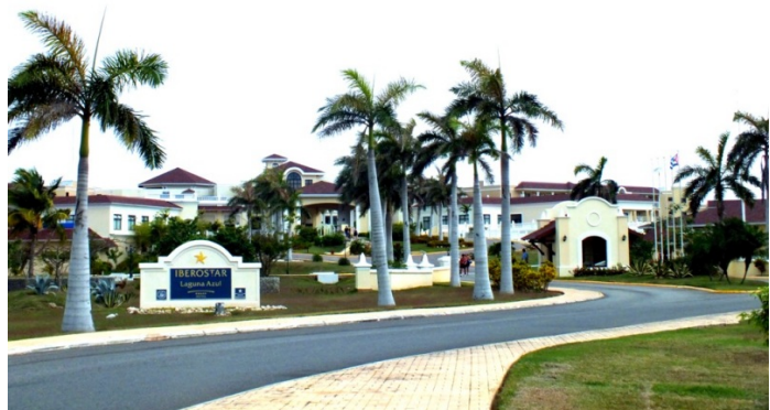
Iberostar, Laguna Azul, Varadero, Cuba